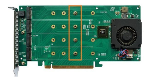
Step 4. The SSDs should be installed from top to bottom. Remove the top screw.