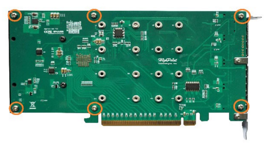
Step 8. On the rear of the SSD7101A-1, refasten the 6 screws that were removed in step 1.

Note: Make sure the aluminum cover is properly aligned with the controller board (PCB), and that it makes full contact with the thermal pad, before refastening it to the SSD7101A-1. If the cover is improperly installed, the fan and thermal pad will be unable to sufficiently cool the NVMe SSD's and controller componentry, which may result in damage to the SSD's or controller hardware, performance loss, unstable I/O, and the loss of data.